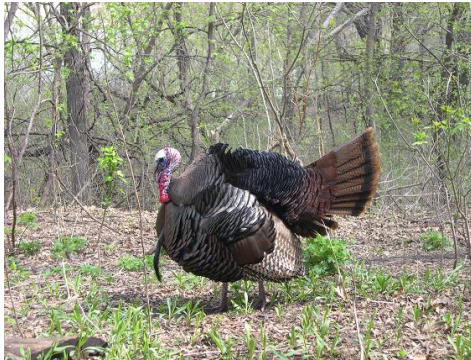
"Bearded" Tom turkey

male that is looking for a hen to breed with.