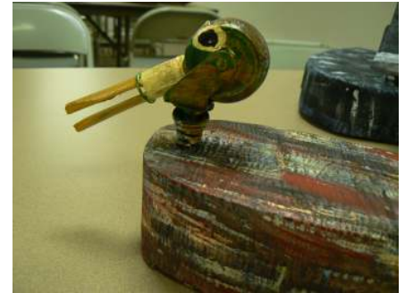
It’s a bird, it’s a plane... it’s a decoy?